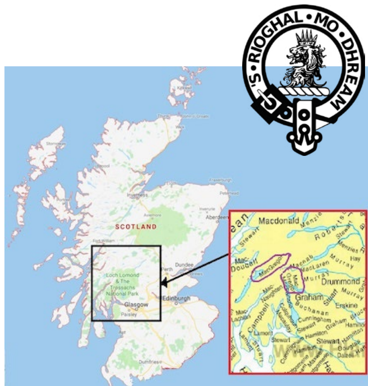
The Clan Gregor held lands in the highlands of Scotland, namely Glenstrae, Glenloch, Glenlyon, Glengyle, and Glenorchy.

Many of the MacGregor's refused. Of those who refused (and were caught); the men were executed, the women were stripped bare, branded, and whipped