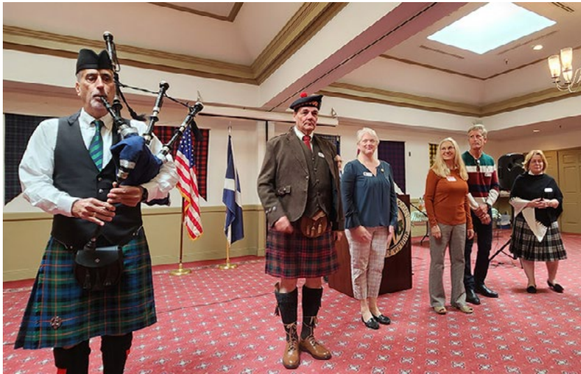
New members are piped in at the AGM held on November 2, 2024.