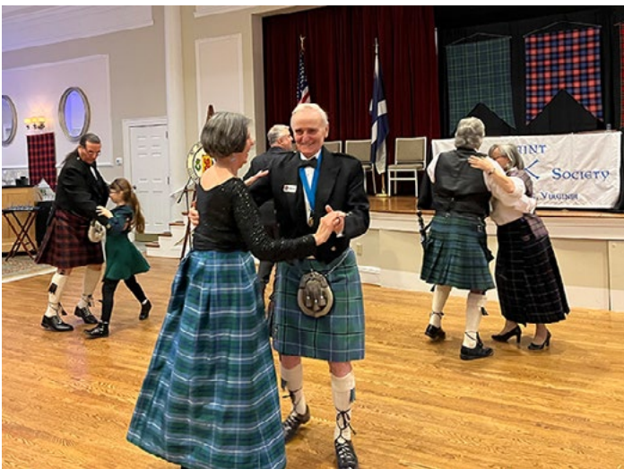
Dancing the Gay Gordons.